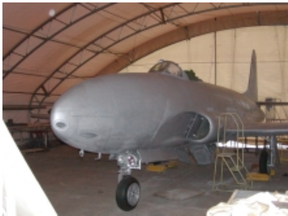
P-80 in it's current state of restoration

As your President I want to thank the Board members and everyone associated with the DVHAA who has made my tenure in office an easy job. I hope to continue to help our organization make progress towards our attainable goal of a World Class Aviation Museum complex in the Delaware Valley.