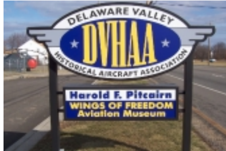
New Sign outside of museum on Rt. 611