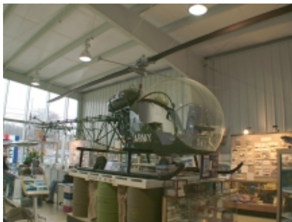
H-13 Sioux on display